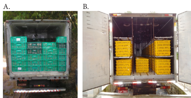
Figure 1. Types of acclimatized transport trucks loaded with fertile eggs (A) and day-old chicks (B) used in this study

The boxes used for transporting present the following measures: 42 x 57 x 15 x 2.5 cm. They have 26 openings around the box (1 x 6.5 cm) that are stacked with the others, in which the last one has a cover full of holes, for minimum air circulation so that animals do not suffer during the trip. There were 4 boxes (maximum number) in each stack found in the superior shelf, 6 boxes in the shelf from the middle, and 6 boxes in the inferior shelf in each side. The load capacity was 480